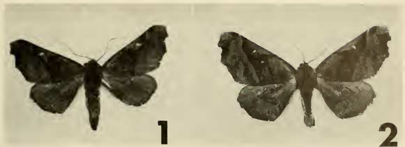
Figs. 1 & 2. Nepitia embra , n. sp.: 1, male; 2, female.

detractaria , occurs from Southern Mexico through Central America into the Andes to Bolivia. The other, embra , n. sp., is limited to Southern Brazil.